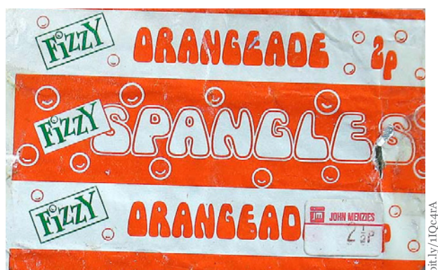
Spangles sweet wrapper