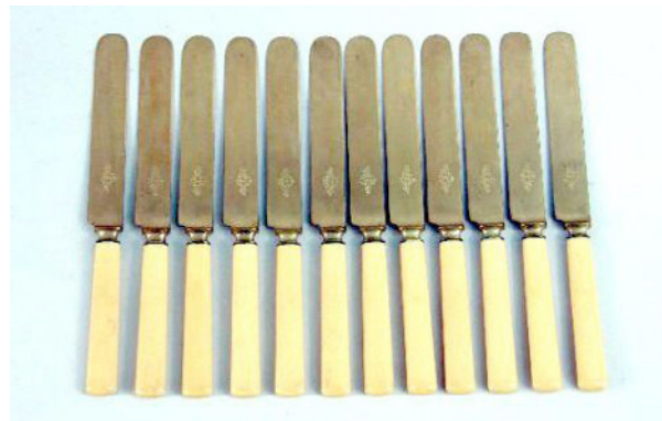
Bone handled knives

We were expected to help with the washing up when I was a child. People didn't have dishwashers in those days – just husbands and children!