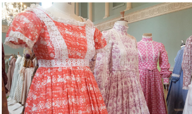
Laura Ashley dresses, 1970s

Laura Ashley went against the trend. She allowed women to wear romantic, rural dresses and floral prints. In the 1970s, much of the country was into glam rock and then punk rock, but Laura Ashley sold blouses with lace collars. And, ultimately, Laura Ashley's fashions have survived where punk rock has not.