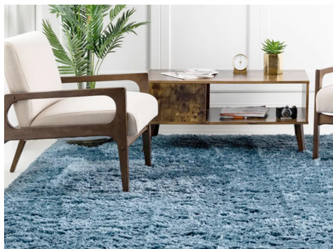
Shag pile carpet

Shag pile carpet was very popular in the 1970s. Some friends of ours had it in their lounge when they moved into a new house. We went to see them soon after they'd moved in. We took off our shoes, and it certainly felt luxurious to walk on in bare feet.