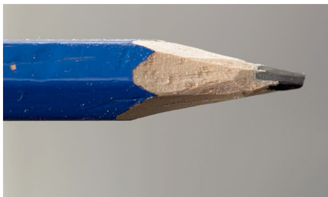
Sharpening a pencil

Dad often wore a jacket. He wore it to work. He wore it round the house, and he always had a pen and a pencil in the breast pocket.