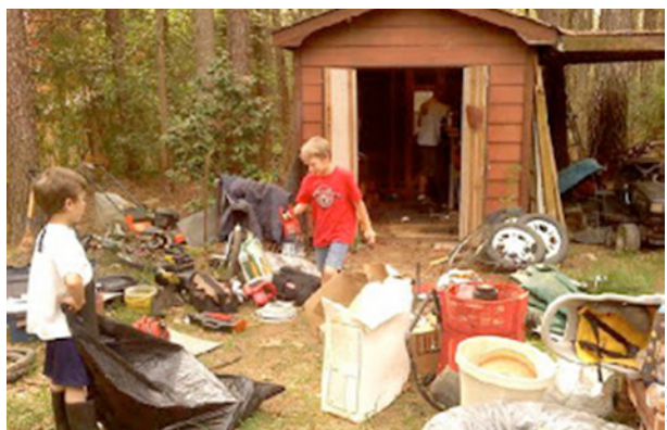
Clearing out the shed