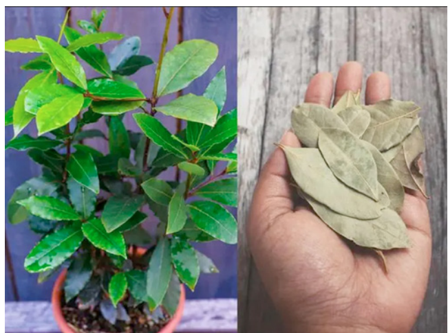
Bay tree and dried bay leaves

Do you like the flavour of bay leaves? I used them in several recipes when I was cooking for the family. I had a packet of dried bay leaves in my herbs and spices drawer.