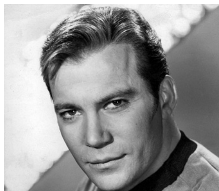
William Shatner in 'Star Trek'

On 8th September 1966, a new adventure started on the television. It was called 'Star Trek'. It was a science fiction series.